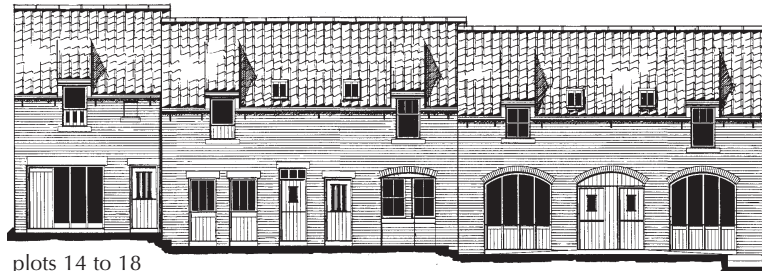
plots 14 to 18