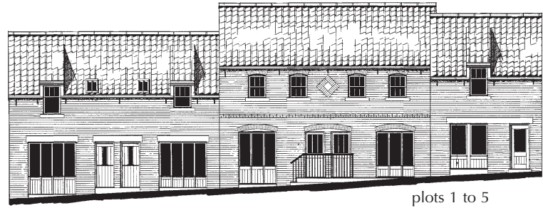
plots 1 to 5

A newly built stylish 2 bedroomed cottage located in the courtyard to the rear of Brotton Hall. The cottages benefit from a fully turfed garden to the rear and a designated parking space along with gas central heating and both bedrooms come with en suite bathrooms. The kitchen comes complete with an integrated oven & hob whilst the purchaser has a choice of unit styles & tiles. The cottages also come with the NHBC 10 year buildmark warranty.