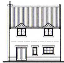
Rear Elevation Scale 1/100