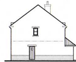
Side Elevation Scale 1/100