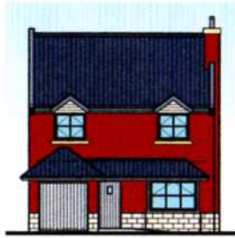
Front Elevation Scale 1/100

Notes Do not scale this drawing. This drawing is available in A3 or A4 or Jpeg format on disk. Copyright The ownership of copyright is retained in accordance with the Copyright Design and Patents Act 1988. Statutory Authority exists for the making of copies in accordance with the Copyright (Libraries) Act 1989. (Reproduction of Copies of Plans and Drawings) Order 1985. The moral rights of Designers (Patents) and Associates LLP is to be identified on the author of this work has been asserted. Ordinance Survey Data Reproduced from Ordnance Survey Supermap Data. © Crown Copyright 1998 in accordance with license agreement.