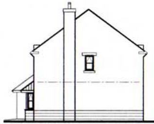
Side Elevation Scale 1/100